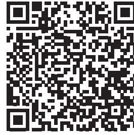
Brochure Premium Check-Up