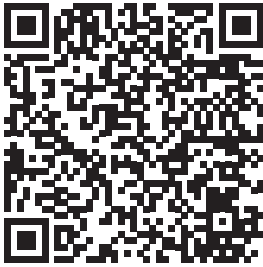
Brochure Therapeutic INUSphere®